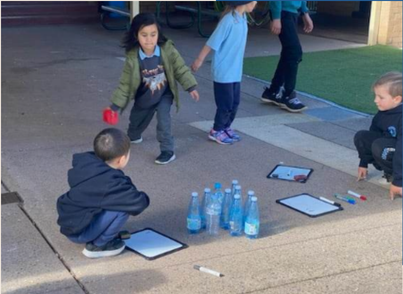
Kinder Skittles game- learning combinations to 10