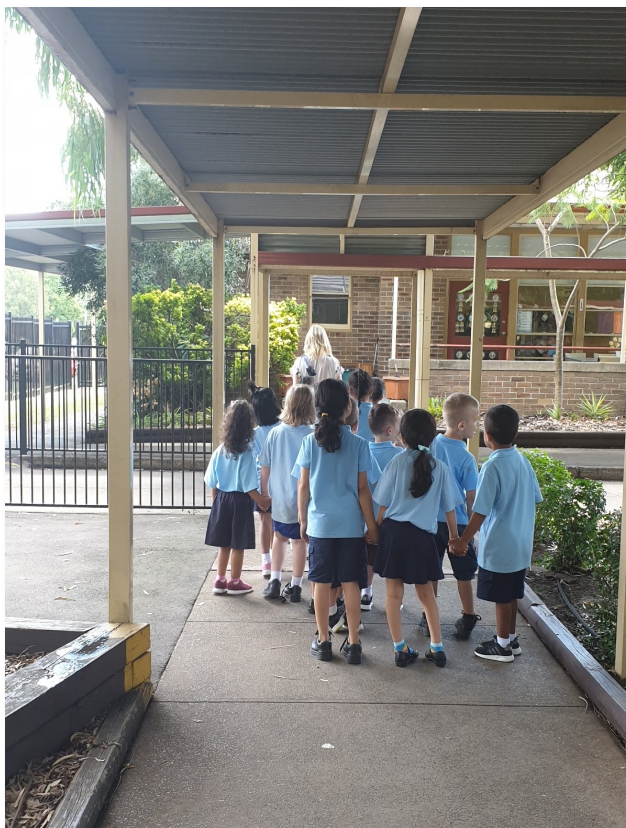
Kindergarten learning about road safety

close the gate and slide the top bolt back into position after moving through the gate. Thank you for understanding our need to ensure every child in our school is safe and cared for.